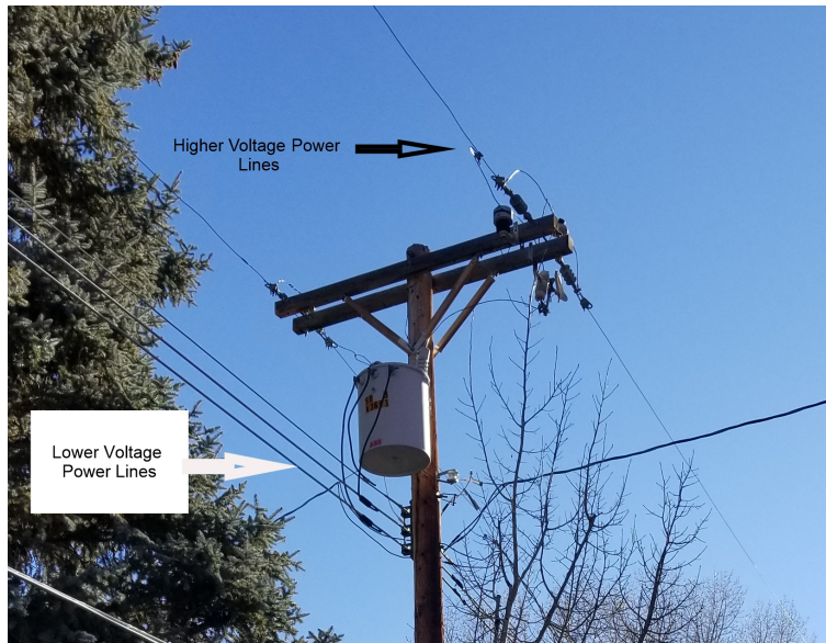
FIGURE 1: Higher and Lower Voltage Power Lines

Category 2: Lower Voltage Electrical Power Lines, Refer to Figure 1. These lines typically carry house voltages (220VAC) and were observed to be installed in two different configurations. The first configuration is shown by 3 separate wires as shown in Figure 1. These lines typically are seen after the transformer. Another configuration is the twisted wires that can be seen in Figure 2. This configuration is typical with lines that are going directly to houses.