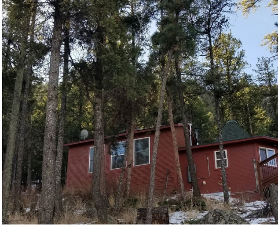
Vicinity of 11010 Hondo: Lower voltage power line interference