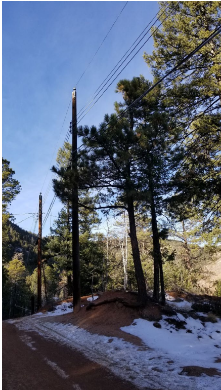
Vicinity of 10995 Hondo: Lower voltage power line interference