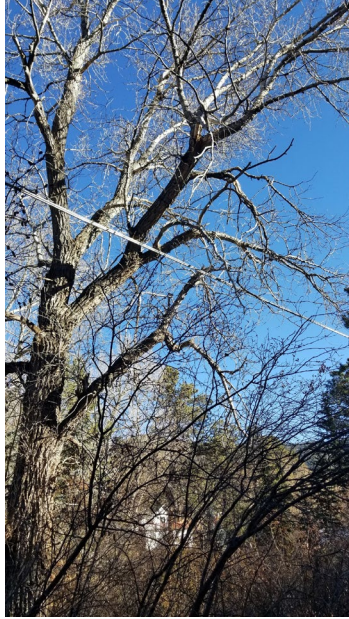
Belvidere: Lower Voltage Power Line Possible Interference and Communication Line Interference