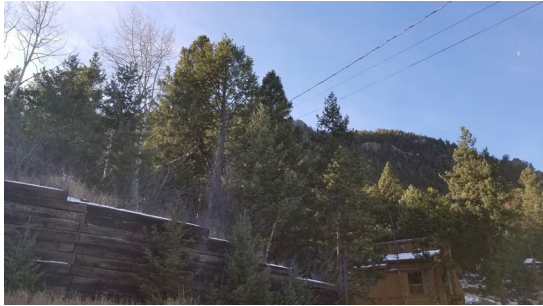
Vicinity of 10650 Hondo Ave: Lower voltage power line interference