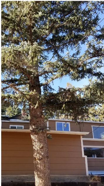
Vicinity of Boulder Street: Lower voltage power line interference