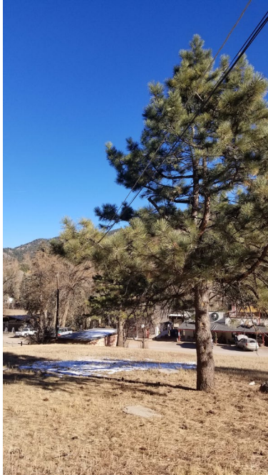
Behind Post Office/Downtown Businesses: Lower Voltage Power Line and Communication Line Interference