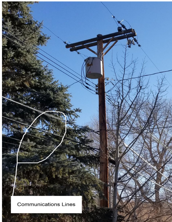
Figure 3: Communications Lines

Category 3: Communications Lines (see Figure 3). Communications lines are those used for internet, television or telephone communications. These lines are typically not as big a concern for fire due to their lower voltages, but can impact emergency communications and evacuation plans.