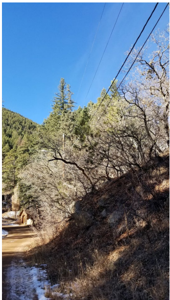
Vicinity of Belvidere: Communications line interferences