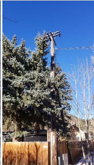
Vicinity of 11010 Hondo Ave: Lower voltage power line and communications lines interference (+downed communication line)