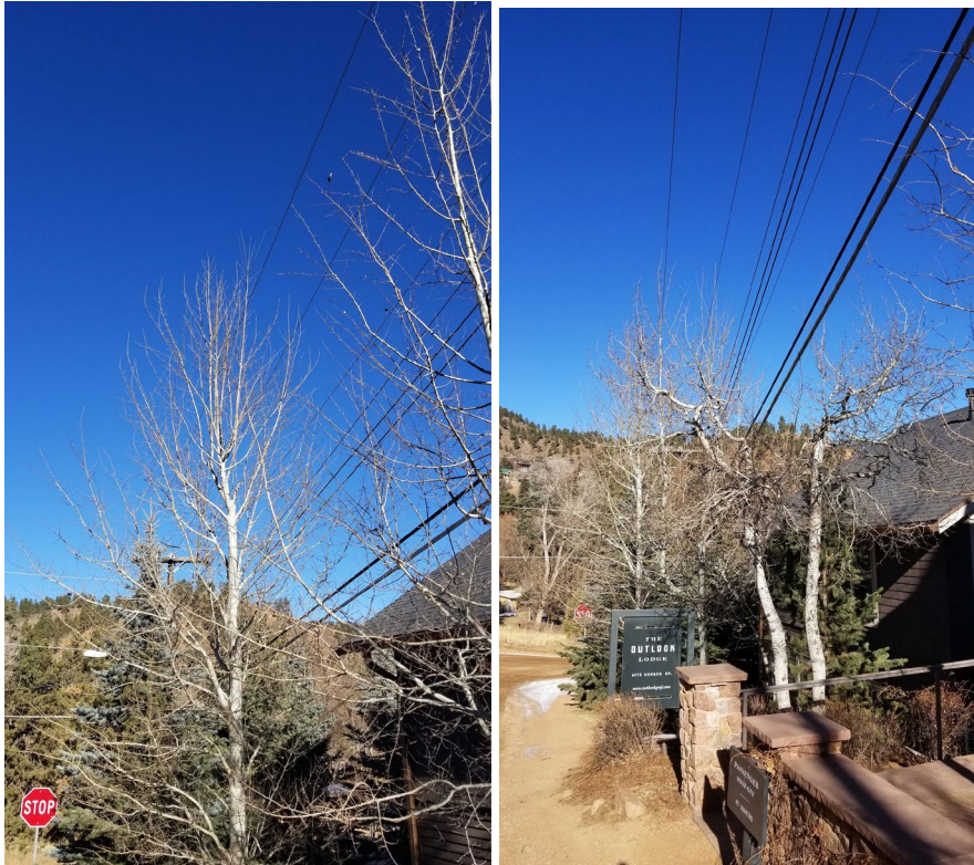
Hondo Ave, Looking towards town: Tree interfering with Communications Line and possibly encroaching on lower voltage power line.