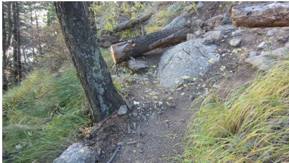
Obliterated social trail with log