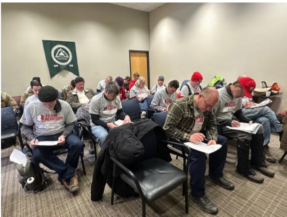
Figure 12 Final Exam!!!