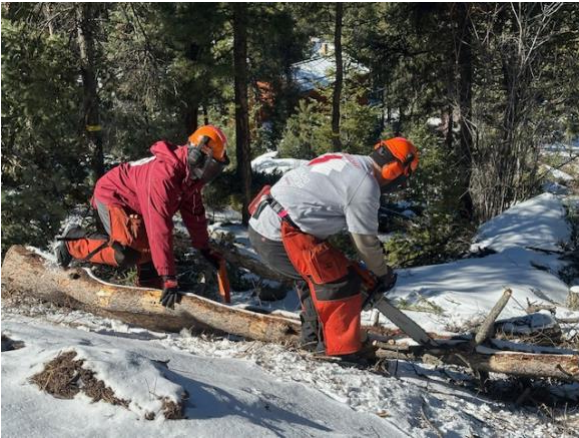
Figure 1 Bucking Limbs