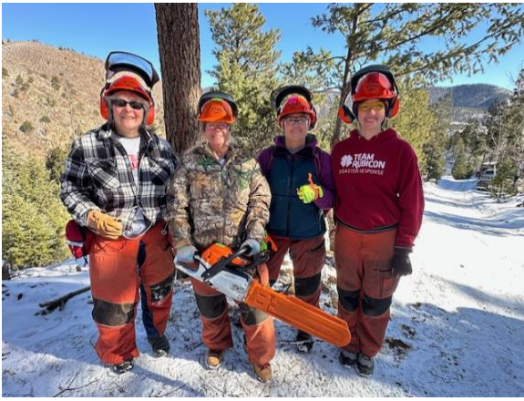
Figure 11 Women in the Trainee ranks