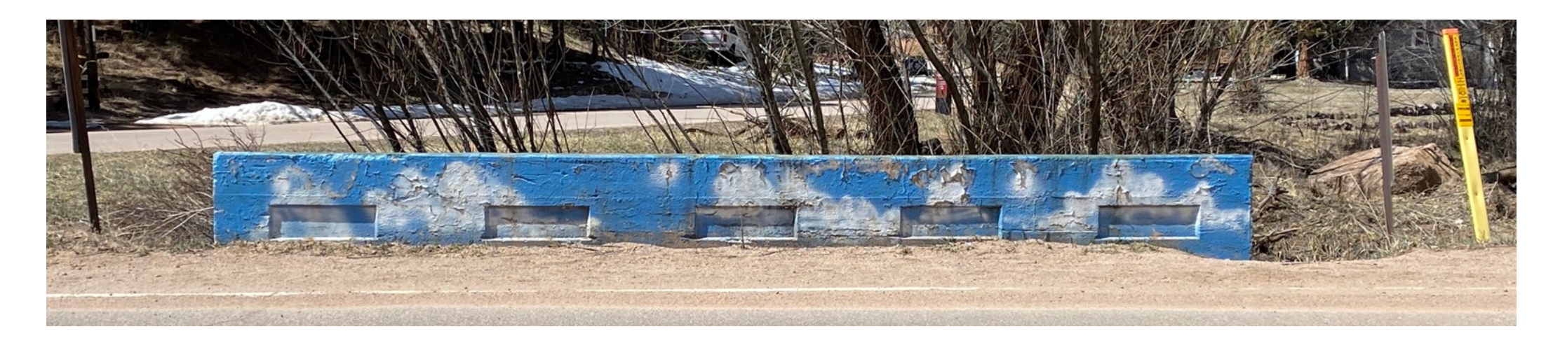
West Side of Ute Pass Ave.