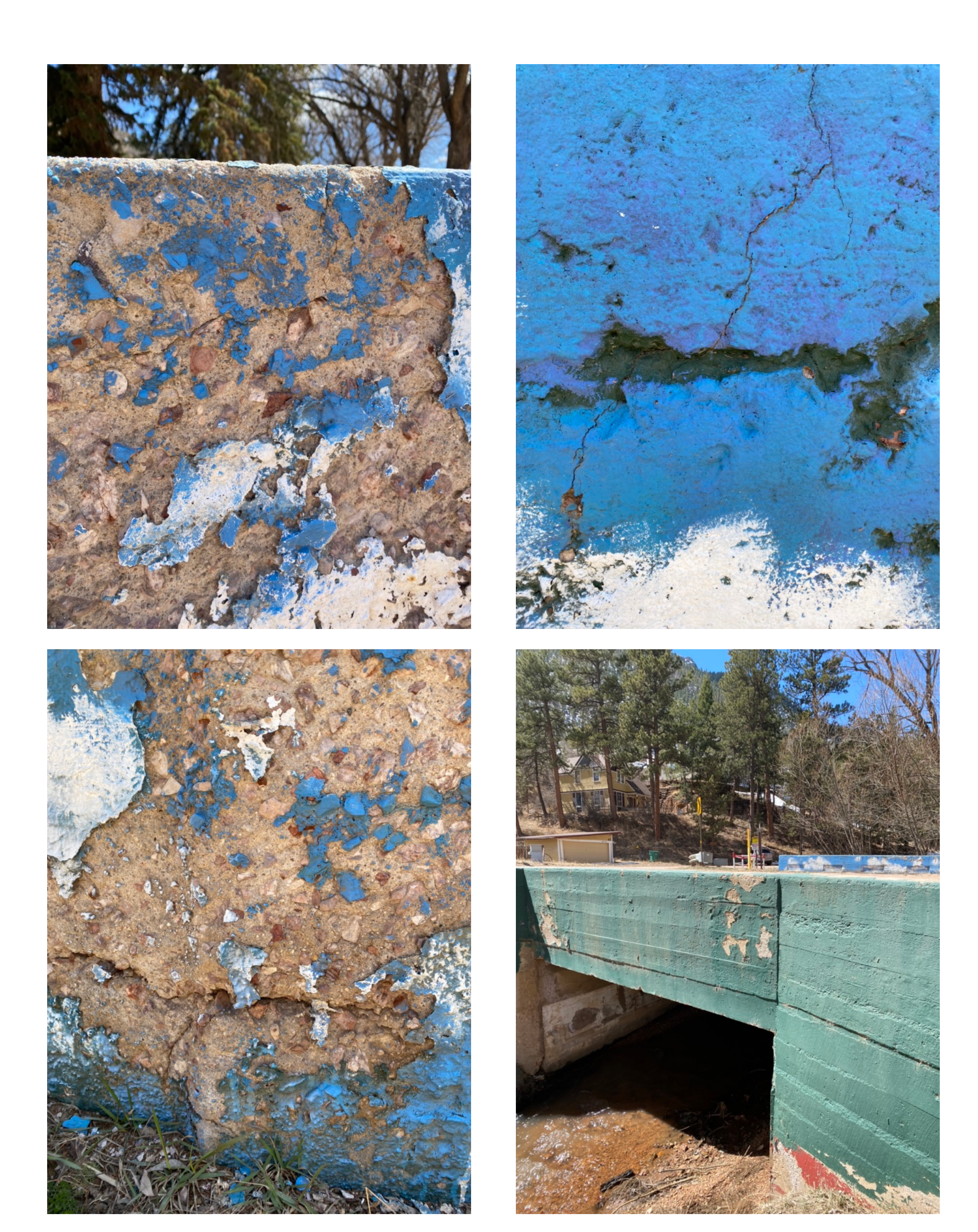
Top L & R, Bottom L - Examples of degraded concrete Bottom R - non street side of barricade