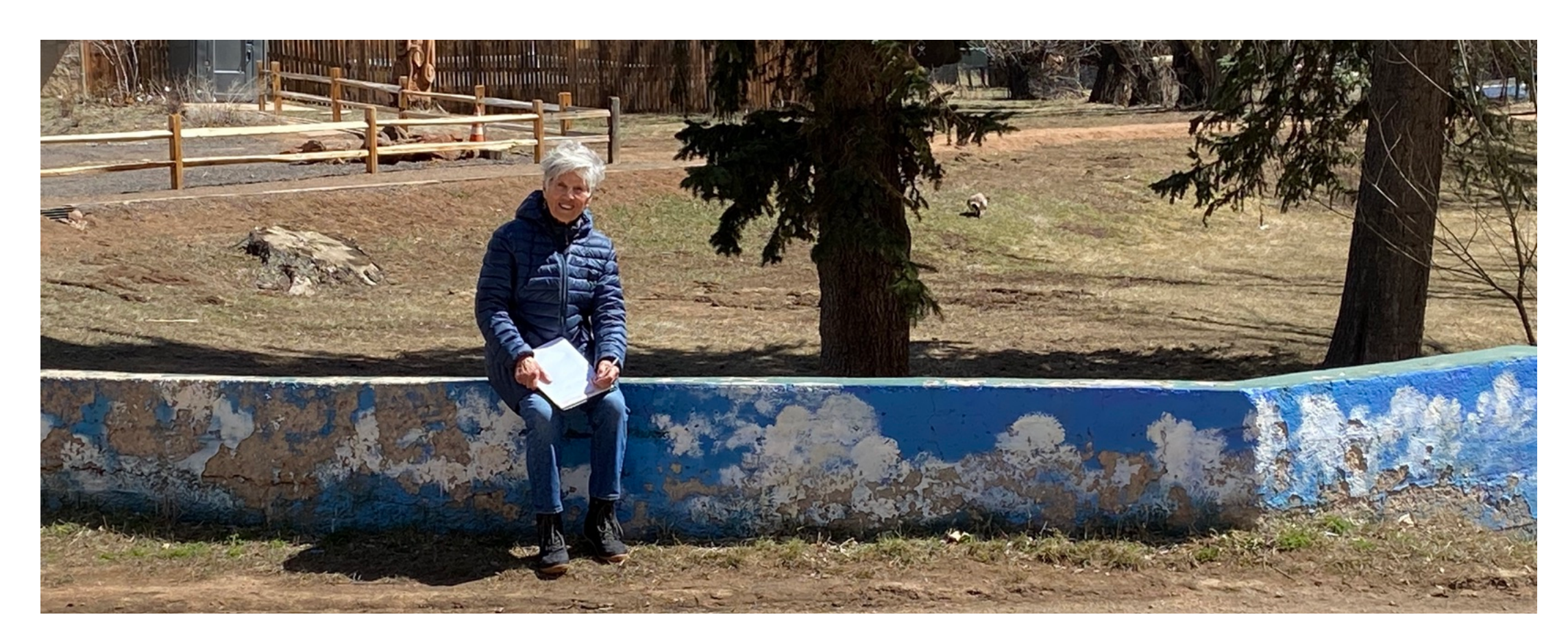
East Side of Ute Pass Ave.