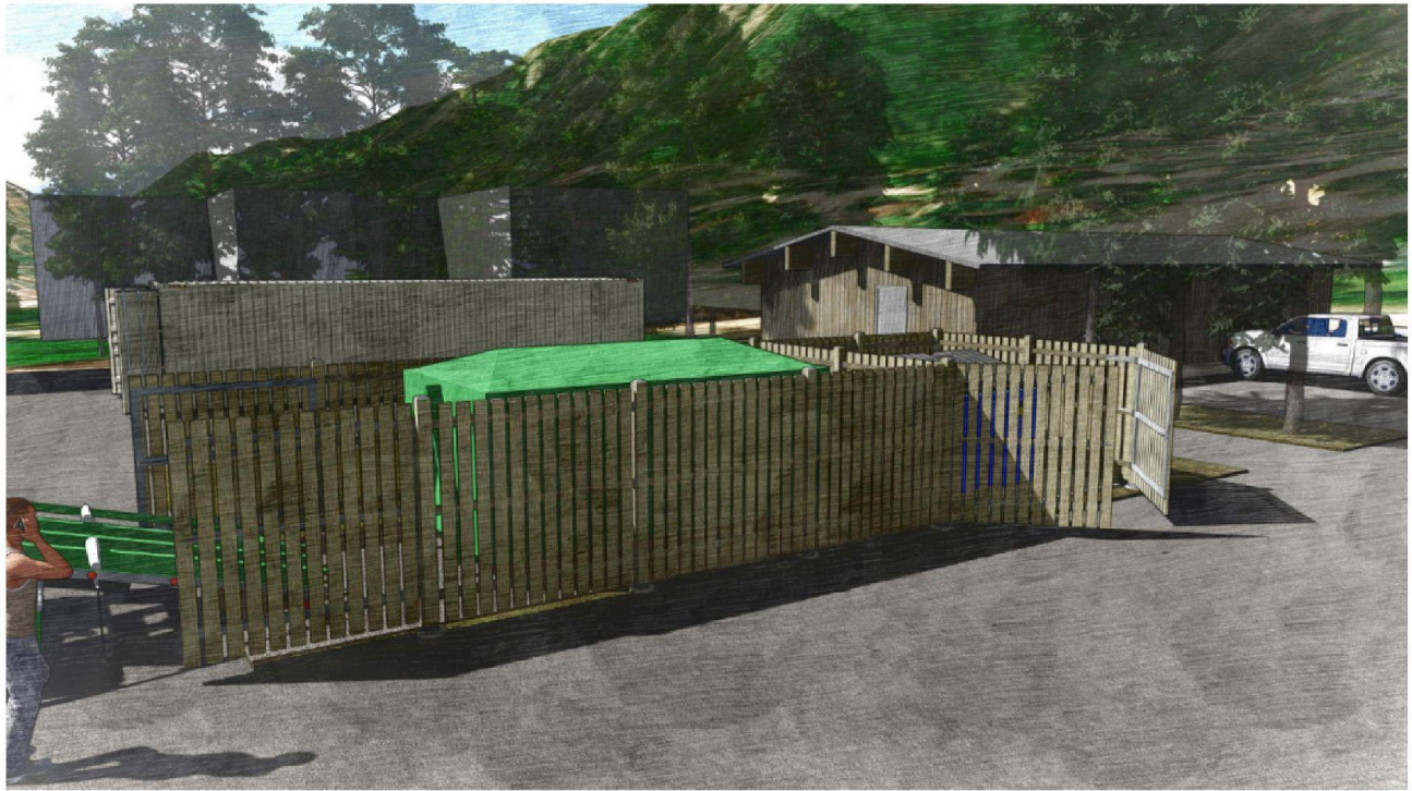
Artist Conception of the Bear Resistant Dumpster Blind...work will be beginning soon